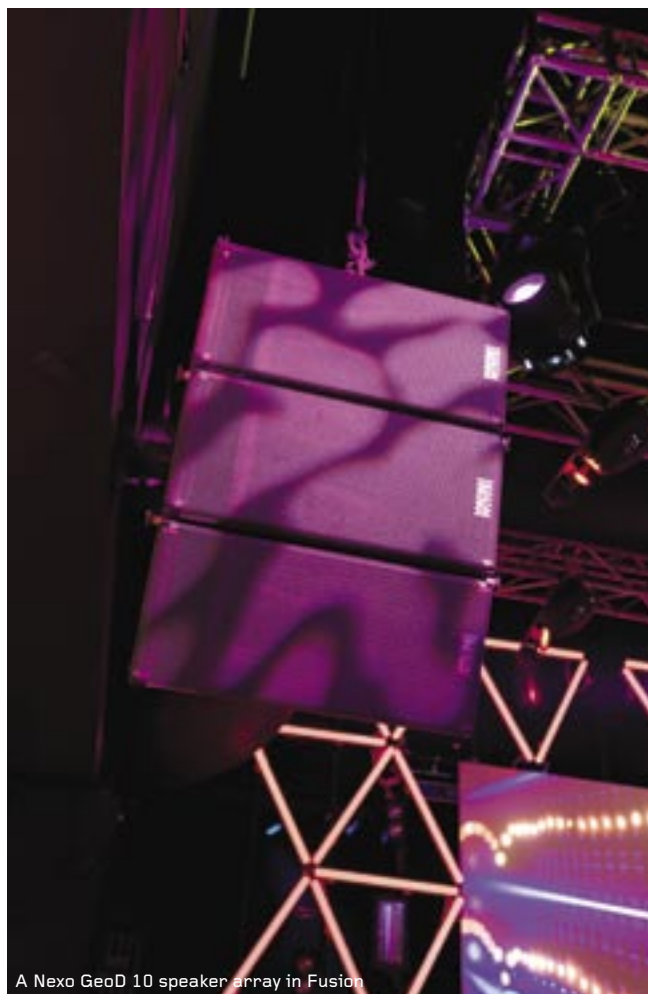
A Nexo GeoD 10 speaker array in Fusion

► As to be expected, it's generally Crown's punters who go there to unwind or wind up, but Odeon's Monday night event is mainly for the entertainment industry. Monday night is their chance to party. That means this club comes under a lot of critical scrutiny, and everything, especially from a tech point of view, has to be top notch.