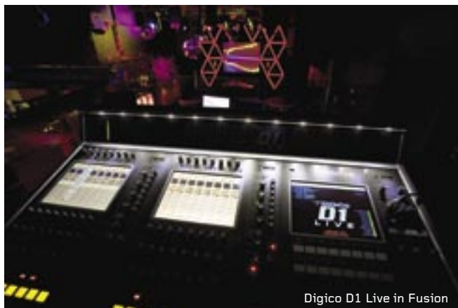
Digico D1 Live in Fusion